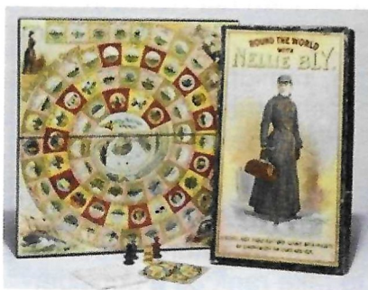
A board game based on her 72-day trip around the world.