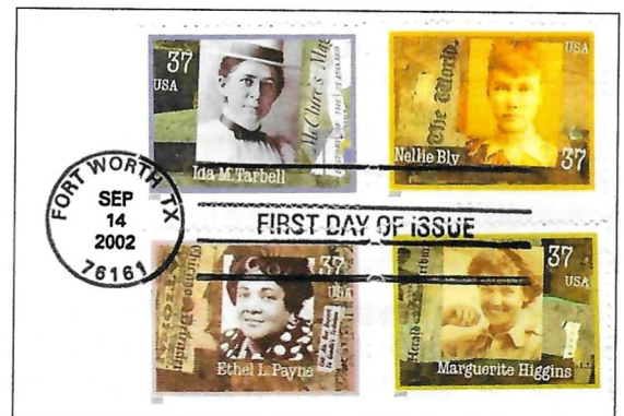
Women Journalists Ethel L. Payne, Ida Tarbell, Marguerite Higgins, and Nellie Bly honored by the USPS in 2002.